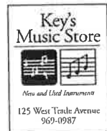
1/4 Page Layouts