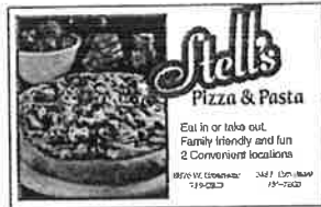
1/2 Page Layouts